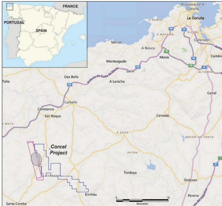
Figure 1. Location map of Corcel Project, Galicia, northwest Spain. Castriz prospect highlighted (grey ellipse).