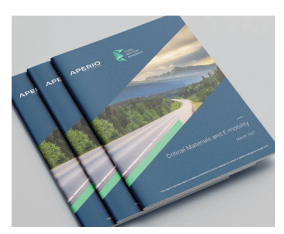
Eurobattery Minerals presents a report on raw materials supply and demand for e-mobility.