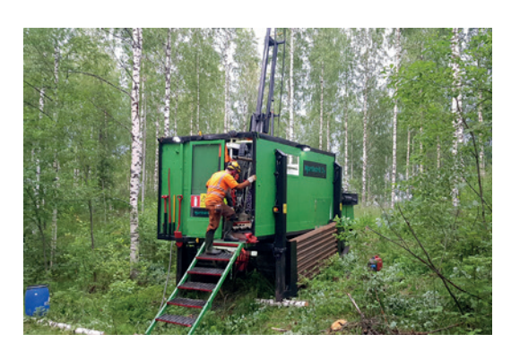
A new drilling campaign that will cover the non-drilled gap area between Hautalampi and Mökkivaara is commenced.