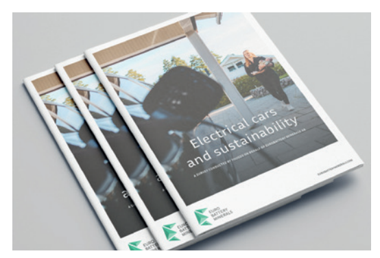
Eurobattery Minerals presents a survey on end-consumer perspectives on electrical cars and sustainability.

▶ Eurobattery Minerals presented a new survey on endconsumer perspectives on electric cars and sustainability. The survey was conducted in Sweden and Germany by the research company YouGov in August 2021 targeting Swedes and Germans who currently own or lease, or are interested in buying or leasing, an electric or hybrid car.