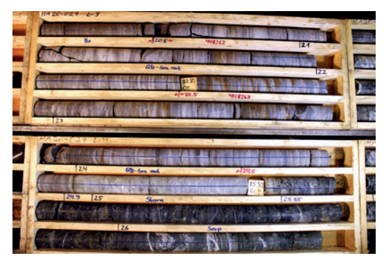
A mineral resource estimation is prepared for the Hautalampi project in Finland.