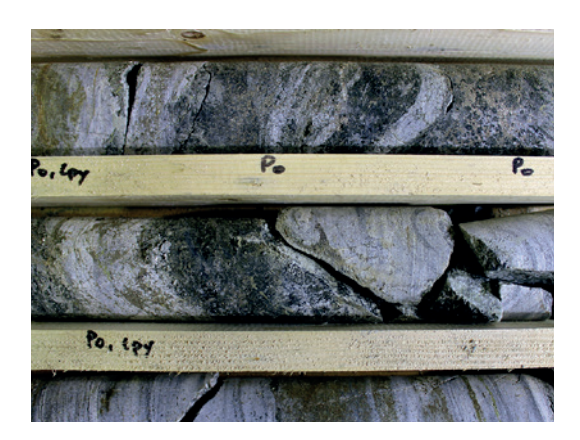
Maiden mineral resource from Hautalampi project in Finland estimates 100 % resource upside.