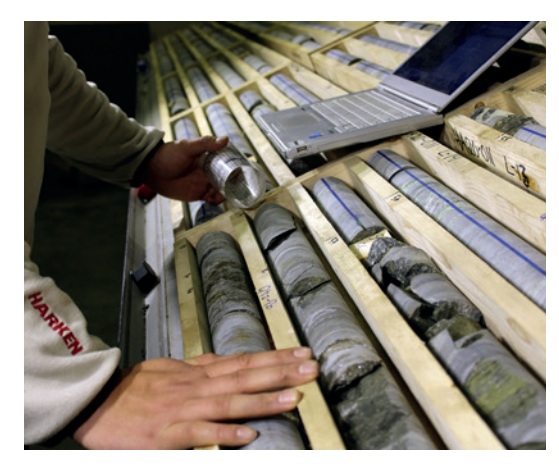
Resource upside at the Hautalampi project.