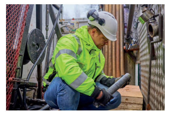
Core drilling results indicates a connection between the resource areas in Hautalamni