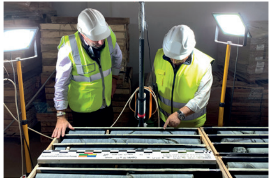
Highly satisfactory results from drillings at the Spanish Corcel Project: Estimated 60 million tonnes with 0.25% nickel.