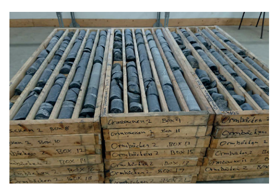
Eurobattery Minerals starts new research collaboration on large-scale extraction of REE in Sweden.