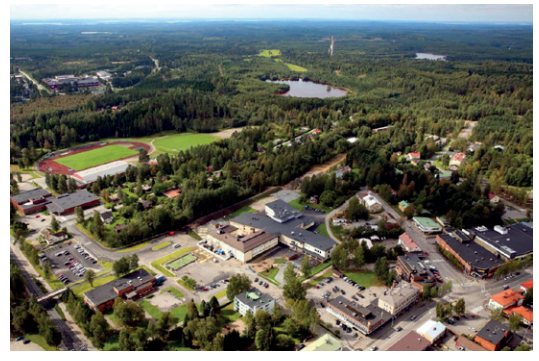
Eurobattery Minerals receives the final verdict of the Hautalampi mining concession proceeding.