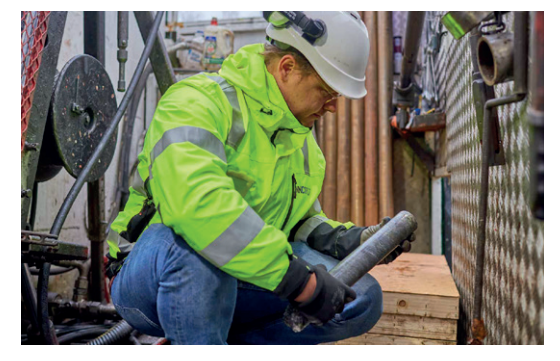
Core drilling results indicates a connection between the resource areas in Hautalampi, Finland.