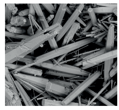
New ground-breaking method allows nearly 100% recovery of REEs in Fetsjön.