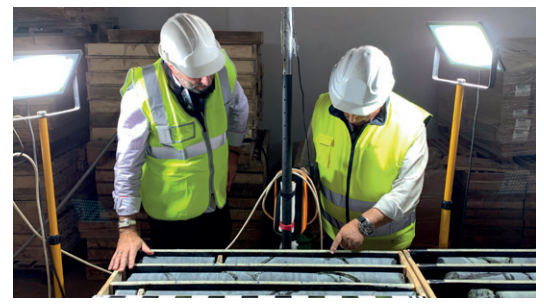
Highly satisfactory results from drillings at the Spanish Corcel Project: Estimated 60 million tonnes with 0.25% nickel.