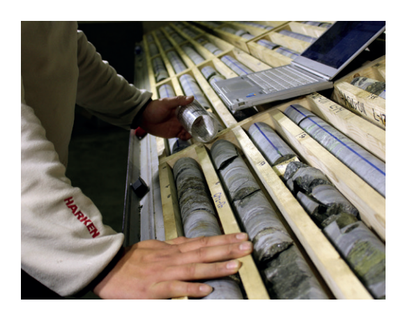
Eurobattery Minerals: Almost 40% increase in the contained metals in the Finnish Hautalampi Ni-Co-Cu mine project.