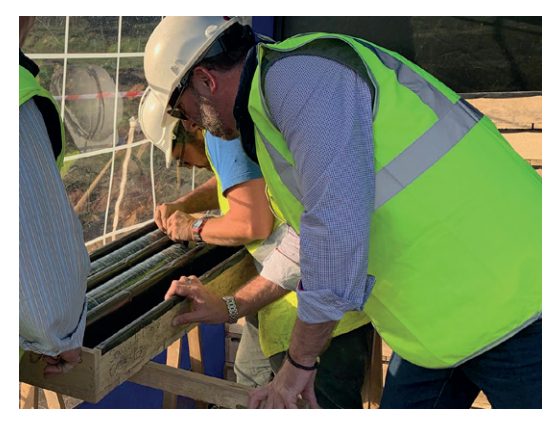
Eurobattery Minerals receives independent NI-43-101 report for the Corcel project.