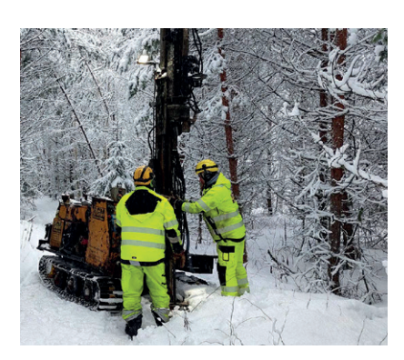
Strong economic outlook for Hautalampi mine according to pre-feasibility study.