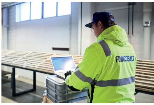
Eurobattery Minerals completes 40% stake acquisition of Finnish Hautalampi battery mineral mine project and directed share