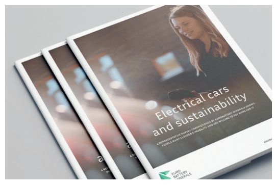
Every second German considers buying an electric or hybrid car.