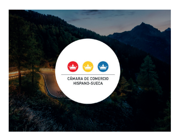
Eurobattery Minerals takes over vice-presidency of the Swedish-Spanish Chamber of Commerce and increases its contribution to the Green Transition.