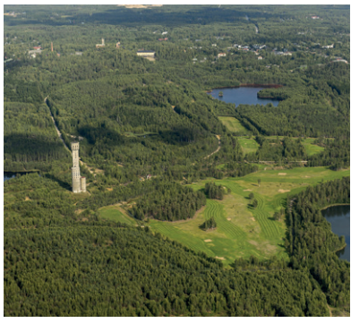
Eurobattery Minerals increases its stake in the Finnish Hautalampi project to 70 per cent.