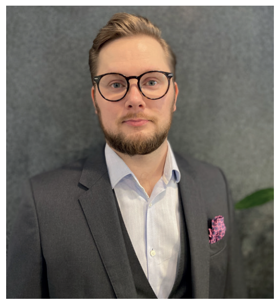
Eurobattery Minerals strengthens Finnish Hautalampi team with new experienced Managing Director.